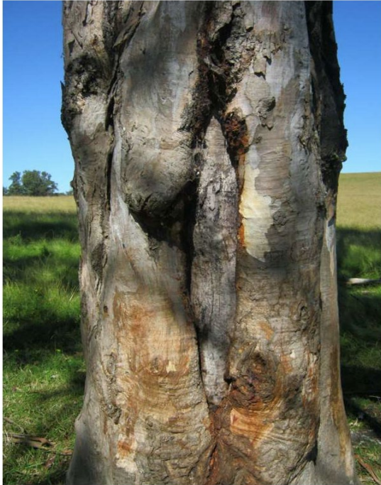
IMG_166 Figure 2: Close up of NW facing scar