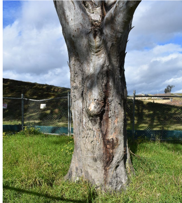
Figure 5 Scar tree WJ-ST-01 (52-2-4081). Photo taken in 2024 by GML during site inspection for the PIHAI.