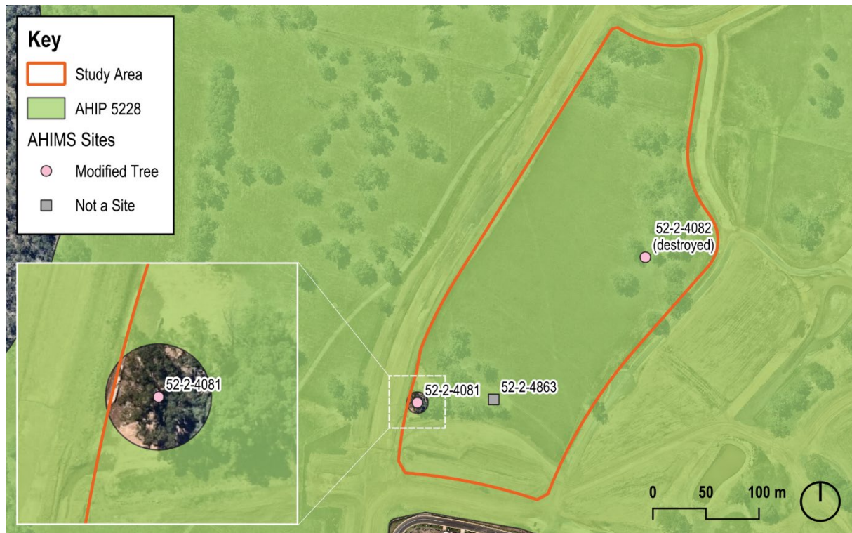
Figure 2 Location of registered AHIMS sites within the AHIP area. Note that AHIP 5288 does not cover the location of scar tree WJ-ST-01 (AHIMS ID 52-2-4081), which is surrounded by a no-harm zone.