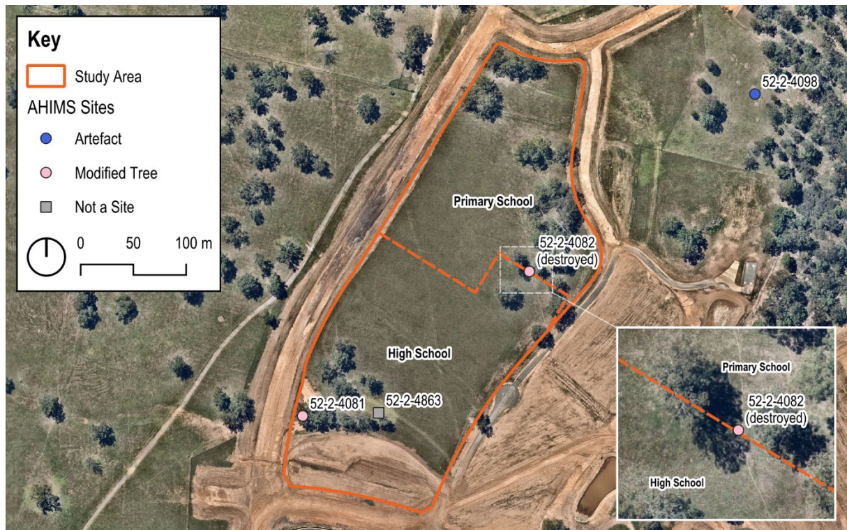
Figure 3 The study area, showing the division (orange dashed line) between the proposed primary school in the northern portion of the study area and the proposed high school in the south of the study area. AHIMS site 52-2-4082 is situated immediately north of the boundary of the two schools, within the proposed primary school, while AHIMS sites 52-2-4081 and 52-2-4863 are located within the proposed high school.