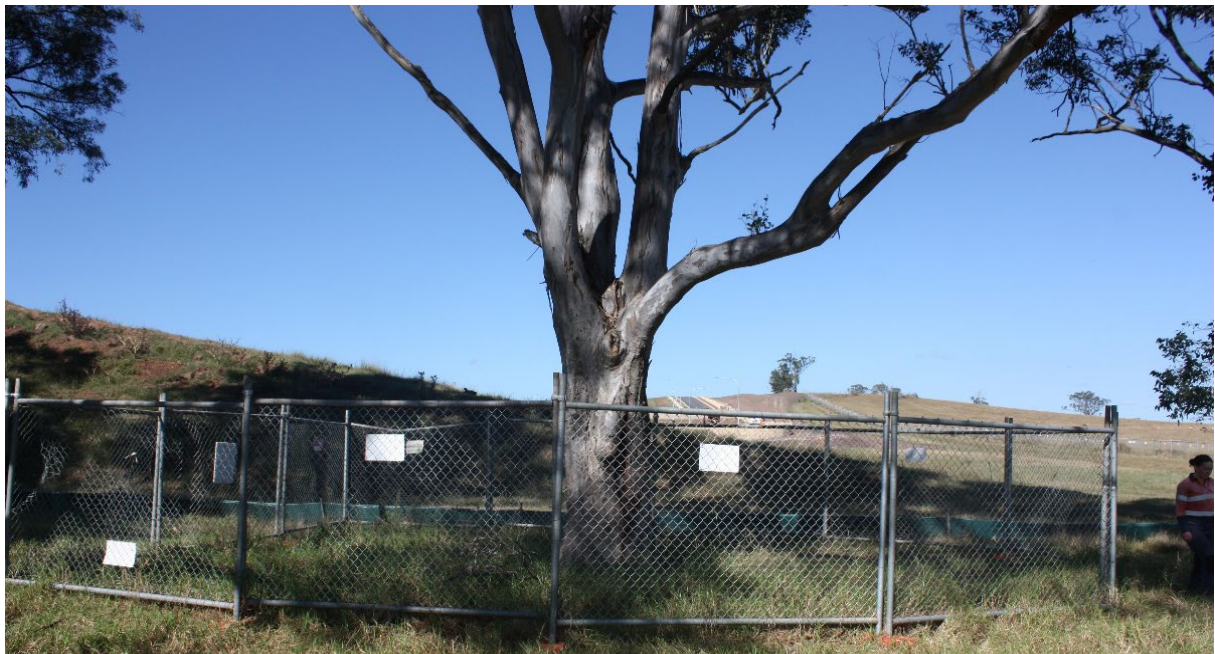
Figure 6 Scar tree WJ-ST-01 (52-2-4081), surrounded by temporary protective fencing during a 2024 site inspection.